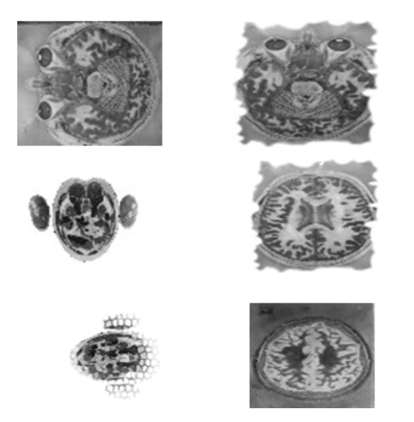
Figure 1. Sample images used in the medical retrieval system.