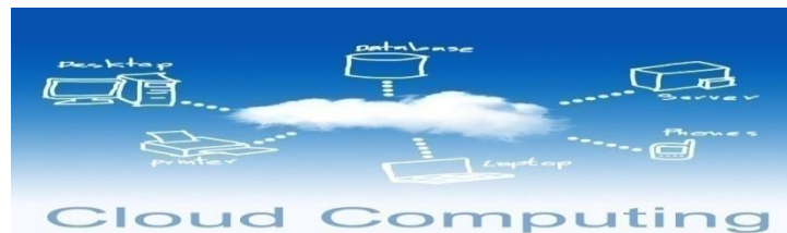
Fig : Cloud Computing

Cloud computing is the use of computing resources (hardware and software) that are delivered as a service over a network (typically the Internet). The name comes from the use of a cloud-shaped symbol as an abstraction for the complex infrastructure it contains in system diagrams. Cloud computing entrusts remote services with a user's data, software and computation.