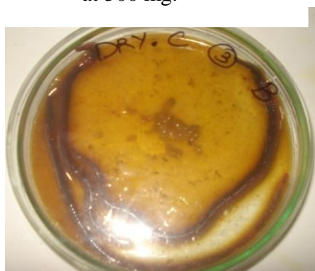
Fig 4: Anthelmintic activity of CM extract in Eisenia foetida at 500mg