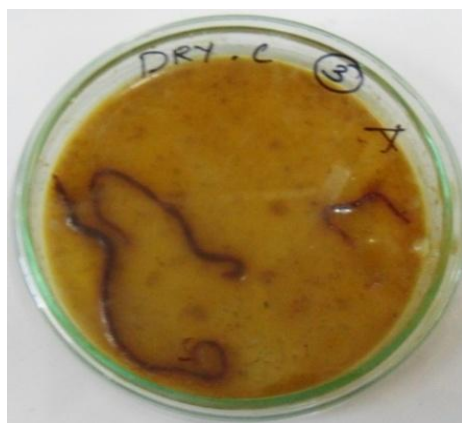
Fig 2: Anthelmintic activity of Soxhlet extract in Eisenia eugeniae at 500 mg.

a- PE:EA(9.5:0.5), b- PE:EA(9:1), c- H:EA(9.5:0.5), d- H:EA(9:1), e- PE:ME(9:1), f- PE, g-H. The spot on the left is for CM extract and that on the right is for SE.