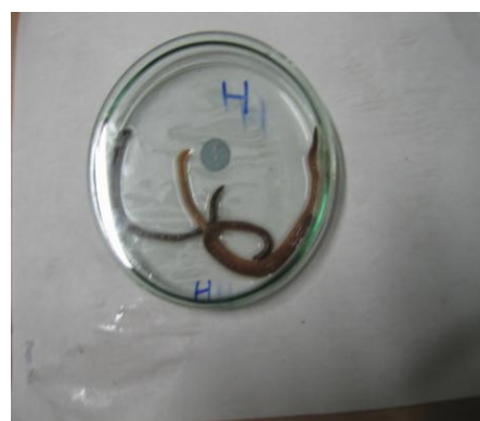
Fig 5: Control Eisenia eugenia in D. water ISSUE 2