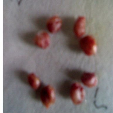
Test compound (I)