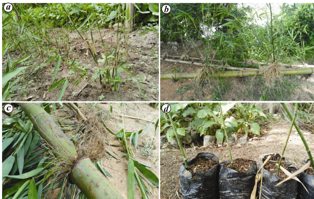
Figure 2. a , Emerged shoots at 28 days after planting (DAP) from culm of Bambusa vulgaris . b , Emergence of shoots and roots at alternate nodes of culm. c , Rooting all around node without shoot emergence on first basal node of culm. d , Transplanted shoots of B. vulgaris in polythene bags.