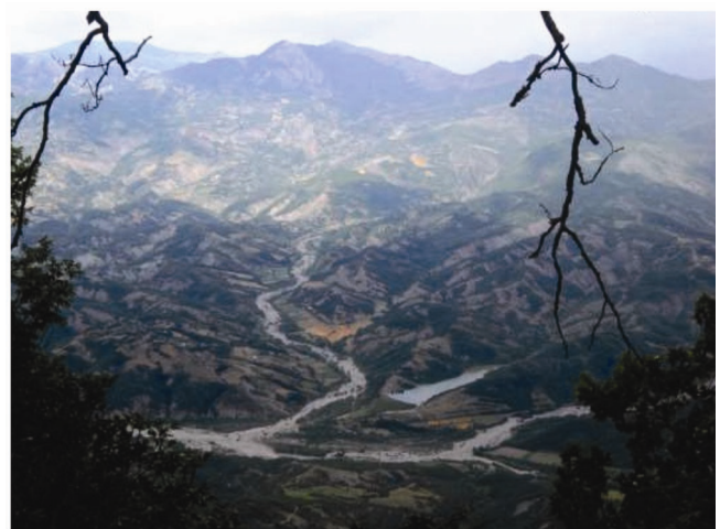
Figure 5. Life-value.