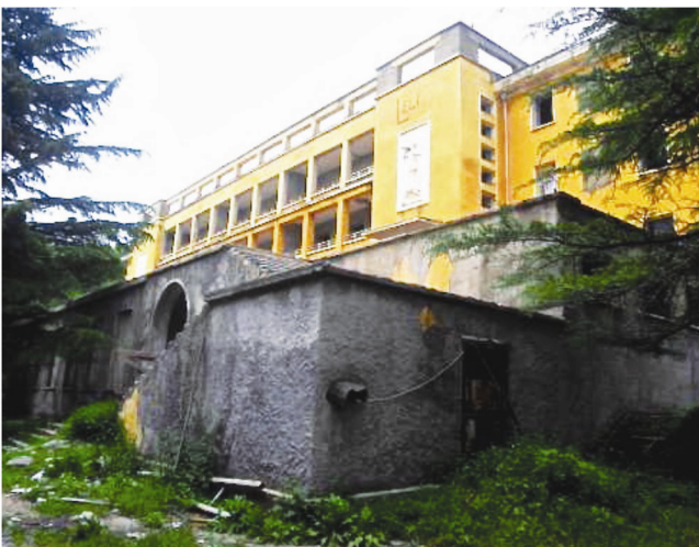
Figure 4. The ostensibly abandoned building.

Following the path behind the yellow house, the forest comes closer. Roads wind between tall, closely packed trees and in the distance there is the sound of traditional Albanian music. The roads are wide and muddy with tracks from motor vehicles. Having got lost, I head roughly towards the right..., which is apparently the