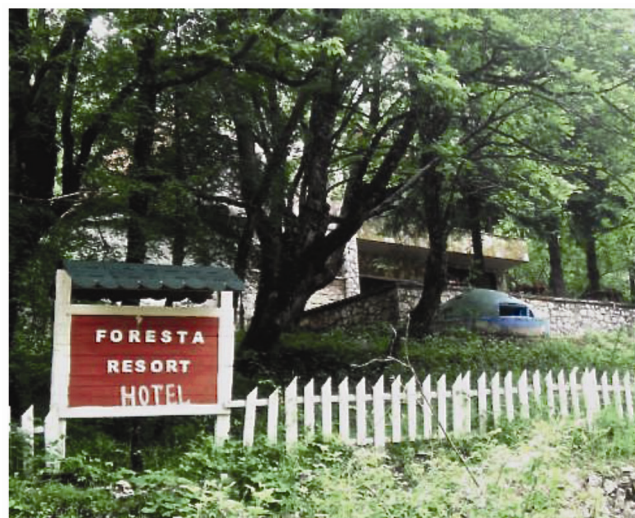
Figure 3. The forgotten bunkerization.

Striking, however, is the lack of visitors in a place that has all the prerequisites for mass tourism. Directly at the foot of the mountain lies a dilapidated hotel, whose once-fine fence protects a large garden – rampant, neglected and overgrown. The big open-air café is empty. The word 'Hotel' has been added to the building's run-down 'Forest Resort' sign. The garden hides several of the grey cement bunkers that the dictator Enver Hoxha forced the country to build in the 1950s during the communist era. These bunkers are found everywhere and cover the entire country. It is estimated that there are around 700,000 of them – in the words of Howden 23 an image of 'paranoia dressed in cement and iron'. For some people, the bunkers are materialized memories of old oppression, while for others they represent a glorious past (Figure 3). But the bunkers in the wild and overgrown garden are isolated,