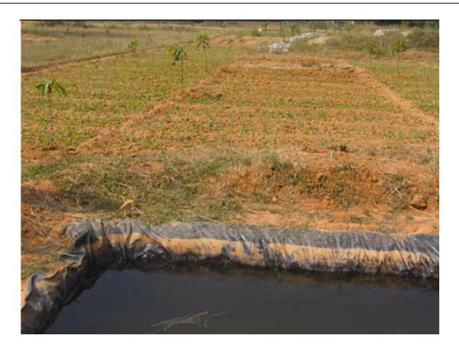
Figure 1. A ready-to-use doba.