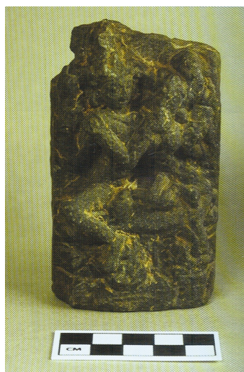
A weathered sculpture of Hara Parvati found from a 'pit' belonging to Period II. The sculpture is made of black basalt.

Excavations at Balupur have revealed the cultural history of the period between 7th and 19th centuries CE, supported by absolute dating methods such as ^{14}\text{C} and OSL of individual cultural periods. Agriculture and trade were the mainstay of