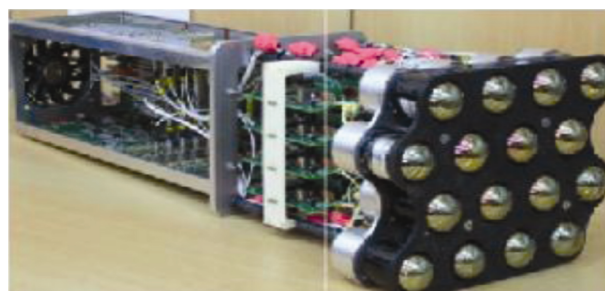
Figure 3. A fully assembled 16-channel camera instrumentation module of the MACE telescope. The 16 photomultiplier tubes can be seen in the front, while the fast signal processing electronics is fixed at the rear of the module.

The 1088 pixel imaging camera has a resolution of 0.125^\circ and covers a field of view of 4.3^\circ \times 4^\circ . Also, 38 mm diameter, six-stage photomultipliers (ETE, UK-make 9117 WSB) arranged at a triangular pitch of 55 mm are used for the detection of the few nanoseconds duration, fast Cherenkov light flash produced by the interaction of the incident VHE gamma-ray photons, protons and other progenitors with the Earth's atmosphere. The photomultipliers are provided with hexagonal front-coated light concentrators for enhancing their light collection efficiency by collecting the photons which fall in the dead space between adjacent photomultipliers. The light collection efficiency of these light concentrators has been determined experimentally to be \sim 85\% in the wavelength range 240–650 nm. The camera is modular in design and comprises of 68 camera instrumentation modules (CIM) of 16 channels each. A fully assembled CIM shown in Figure 3 houses the photomultipliers, high-voltage