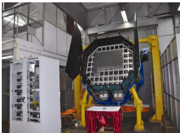
Figure 4. The partially assembled imaging camera of the MACE telescope at ECIL, Hyderabad in June 2016. The central 19 CIM modules can be seen along with the two motorized front shutters. The 48 V power distribution rack connected to the camera can be seen on the left of the photograph.

generators, signal-processing electronics, first-level trigger generation logic and signal digitization circuitry for the 16 channels. Figure 4 shows the partially assembled camera and its power supply rack. An analogue switched capacitor array DRS-4 developed by PSI, Switzerland is being used as an analogue ring sampler at 1 GHz speed for continuous digitization of the photomultiplier signals. These digitized values are stored only for channels which have triggered. In order to ensure a large dynamic range, the photomultiplier signal is simultaneously amplified by a gain of 14 and 140. If the high gain output saturates, then the low gain output is used for further processing. The amplitude discriminator output of each channel is used for monitoring its single channel rate and also for generating the first-level trigger from an individual CIM. The first-level triggers from all the modules are collated