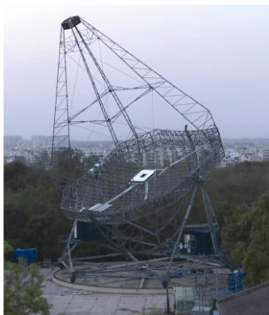
Figure 2. Trial assembly of the mechanical structure of the MACE telescope at ECIL, Hyderabad in June 2014. A set of eight aligned mirror panels can be seen in the centre of the mirror basket.

The 21 m diameter mirror basket of the telescope has 356 square mirror panels of 984 \text{ mm} \times 984 \text{ mm} fixed on it. Each mirror panel comprises 4 \times 488 \text{ mm} \times 488 \text{ mm} spherical mirror facets pre-aligned to give a spot size of <4 \text{ mm} diameter at its focus for a parallel beam of on-axis light. A structurally rigid mirror blank is made by sandwiching a 26 mm thick HEXEL aluminium honeycomb structure between a 5 mm thick aluminium