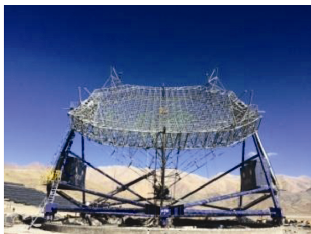
Figure 5. The status of the telescope installation at Hanle in December 2016. The two instrumentation shelters are mounted on the alidade structure. The solar photovoltaic panels deployed for providing electric power to the telescope can be seen on the left of the photograph.

in a second-level trigger generator where proximity of the triggered pixels in adjacent CIMs is checked. After the generation of the second-level trigger, the data from all the 68 modules are collated by the data concentrator, which in turn sends them to the data acquisition computer in the control room through optical fibres. The innermost 576 pixels ( 24 \times 24 ) are used for generating this trigger according to predefined logic. As mentioned earlier, the topological trigger scheme uses CCNN patterns which are predefined for nearest pairs, triplets, quadruplets, etc.