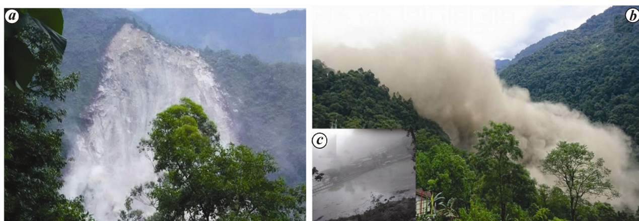
Figure 1. Photographs of ( a ) the Mantam landslide, ( b ) dust cloud from the landslide, ( c ) artificial lake formed due to the landslide dam.

Landslide resulting in river blockage presents a serious threat to downstream settlements. In recent times, we have recorded two large events of valley-blocking landslides in the Himalaya. The August 2014 Sunkoshi landslide 8 resulted in a ~2 km long lake on the Sunkoshi river, which is one of the main tributaries of the Kosi River as it enters India. This has led to large-scale human evacuation in Bihar. Similarly, the Phuktal river landslide 9 in Jammu and Kashmir, India resulted in the formation of a ~17 km long lake which needed regular monitoring to avoid major flash floods in the downstream areas. The water impoundment in case of the ‘So Bhir’ landslide is a potential threat to settlements in downstream areas and to the Teesta Stage-V project of National Hydroelectric Power Corporation (NHPC). We estimated the volume of lake water from a 10 m CartoDEM using the polygon volume method. The water volume was estimated as 2.16 million m 3 and assuming that the lake would be emptied in 30 min in case of a sudden breach, the discharge was estimated at 1202 m 3 /s. For this amount of discharge, we carried out a risk analysis for possible inundation due to flash floods for a distance of