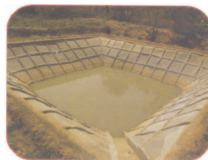
Farm pond for ex situ rain water harvesting.

The importance and effectiveness of people's participation in the management of groundwater resource have been illustrated through interesting case studies and analyses in the book. A few case histories of successful water harvesting and conservation efforts with community participation in the Aravari basin in Rajasthan and Ichalahalla, Kumudvathy and Vedavathy watersheds in Karnataka have been discussed in detail. This has brought out the importance of integrated watershed management based on indigenous knowledge systems with modern inputs for all-inclusive rural growth.