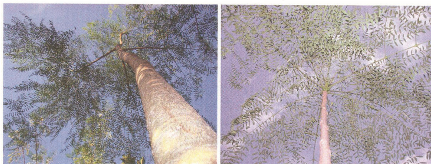
Moringa drouhardii growing in Florida from a seed of Madagascar origin.

The focus of the book is extremely relevant today as only a small fraction of the known plant wealth has been put to use for medicinal, nutritional or other requirements. Species diversity and genetic diversity are viewed as a measure of chemical diversity and different species are expected to generate a range of proteins and secondary metabolites which