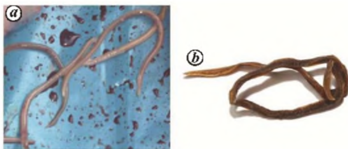
Figure 1. Paradujardinia halicoris : a, live; b, dead.