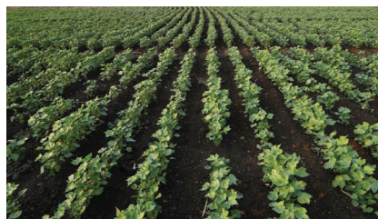
Cotton necrosis can reduce the yield by more than 60% in such healthy fields.

The researchers isolated rhizospheric and endophytic bacteria from both tobacco streak virus infected and symptomless cotton plants. They then enumerated the microorganisms in soil samples. They isolated and characterised the bacteria using the 16S rRNA gene. The phylogenetic tree showed a variety of bacillus species. The team observed that healthy plants had more microbial diversity than infected plants. Do some of these bacteria confer resistance against the virus?