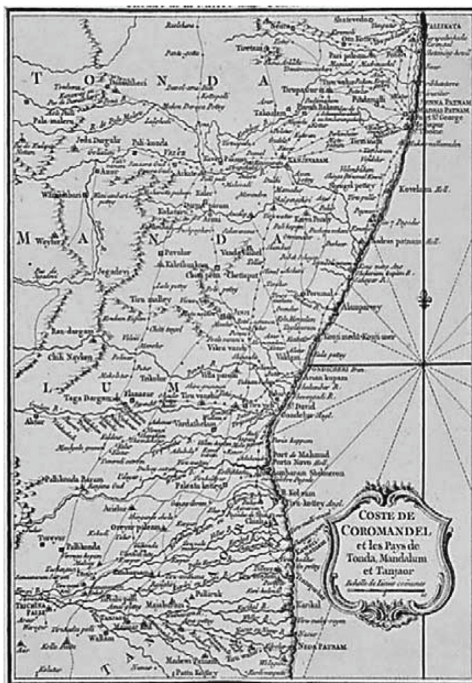
Figure 2. Map of the Coromandel Coast by Jacques-Nicholas Bellin in Le Petit Atlas Maritime Recueilli de Cartes et Plans des Quatre Parties du Monde , 1764, vol. III. Bellin refers to the western and southern districts of Fort St George as Tondai Mandalam and Tanjaour (Tanjavur Kingdom). Tondai Mandalam was commonly used at least until the later decades of the 19th century. Tondai is Capparis zeylanica (Capparaceae) and mandalam means a vast area: a vast area occupied by dense C. zeylanica populations.

'My opinion of the plants you collected at Unanercoonda , about twelve miles (19.3 km) from Fort St. George.