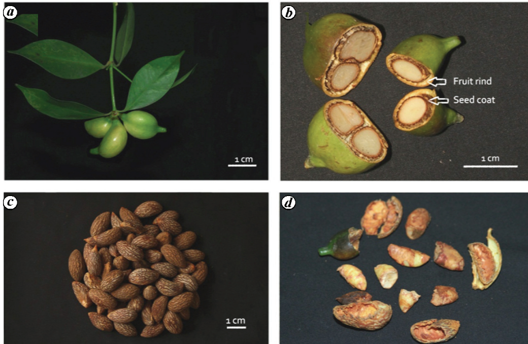
Figure 1. a , Garcinia imberti fruits. b , Cross section showing single and double seeded fruit. c , Mature seeds. d , Predated fruit/seed portions.

decoated middle section (C5 – 30% seed content simulating 70% predation of proximal and distal ends), decoated distal section (C6 – \pm 50% predation of proximal end), decoated distal section (C7 – \pm 30% seed content simulating 70% predation of proximal end) and decoated distal portion chipped (C8 – 90% seed content simulating 10% predation of proximal ends) simulating the different modes of predation 4,5 . Thus the germination trials consisted of 14 treatments: P1 to P5 for naturally predated seeds, C1 to C8 for simulated treatments of predated seeds and C as control.