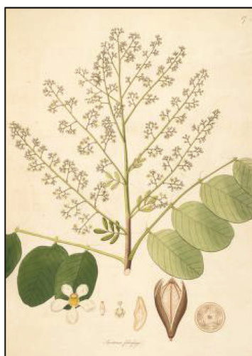
Figure 2. Original engraving of Swietenia febrifuga in William Roxburgh’s Plants of the Coromandel , vol. 1. 1795

He speaks of practices such as plant veneration, celebration of nature, emotional values attributed to plants, ritual-specific uses of plants, and ecological consciousness recited as stories and verses. He describes the perceptions of plants and other elements of nature among the people of the Western Ghats, and contrasts them with the economics-driven ‘values-based-on-use-and-utility’ paradigm. One element that comes out powerfully in this chapter is the imperative need for us – humans – to shed the arrogant technocentric attitude, which has been driving us for the last few decades. Such a technocentric behaviour has led us to imagine that we are the world’s most superior organisms. The kinds of peoples and their attitudes, Somashekhar speaks about, demonstrate that we – the human species – are indeed a diminutive fragment in the overall schema of the natural world. Whether a redemption from such a thinking, deeply soaked in arrogance, is a possibility, I am not sure, because selfishness and ego dominantly steer us. Realistically, a shift towards ecological thinking coincides with an emotional shift to seeing ourselves as an integral part of a more complex and larger natural world. Such a shift will gel well with the shift from the supercilious efforts of humans to dominate over nature. The chapter was engrossing, but I felt traumatized by the use of the economic term ‘resource’ at many a place, which could have been simply replaced by the sobre term ‘material’.