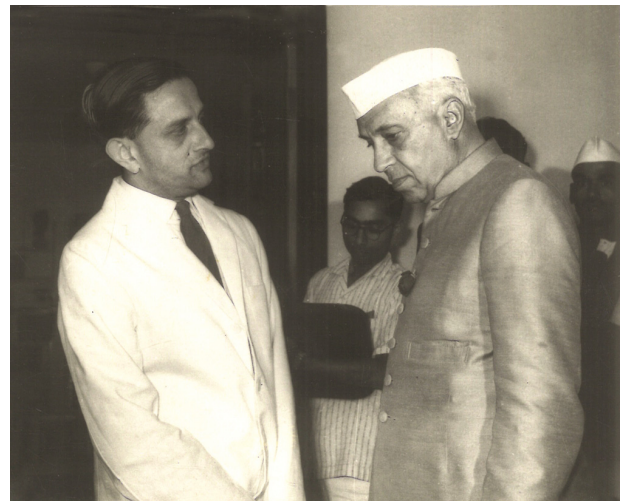
With PM Nehru at the inauguration of ATIRA and PRL at Ahmedabad in 1954