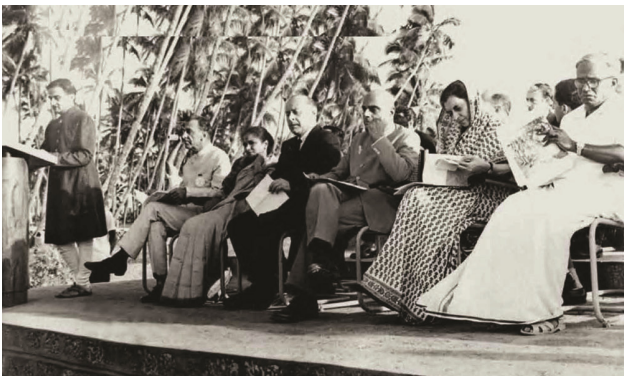
Prime Minister Smt Indira Gandhi dedicated TERLS to the United Nations on 2 February 1968