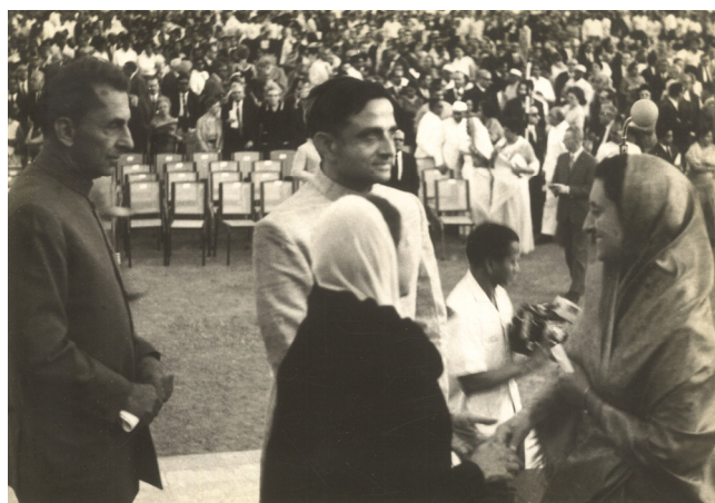
PM at TERLS