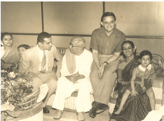
With family members