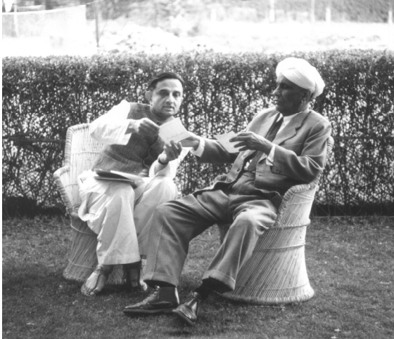
With Prof. C. V. Raman at PRL, Ahmedabad, in 1970