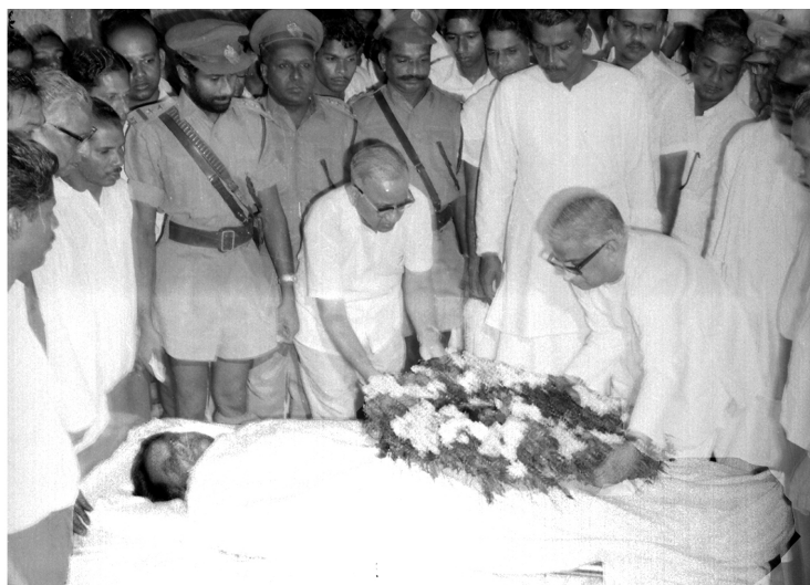
Vikram Sarabhai died on 30 December 1971 at Kovalam, Trivandrum, the Governor of Kerala visited the hotel