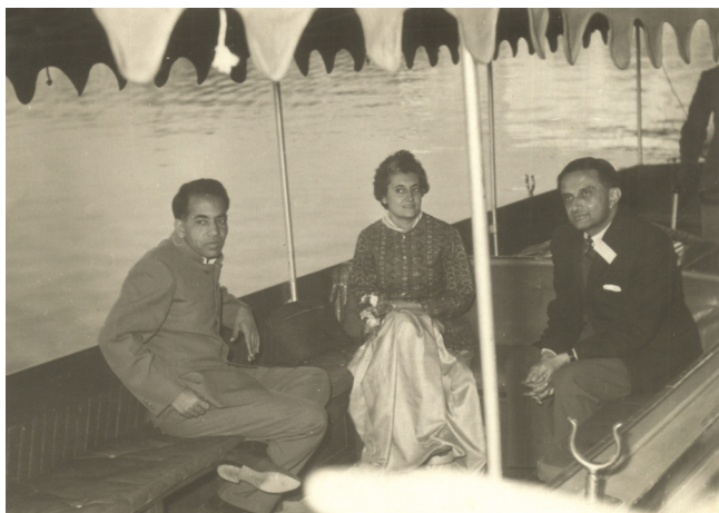
With Smt Indira Gandhi at the Pugwash Conference, Udaipur, February 1964