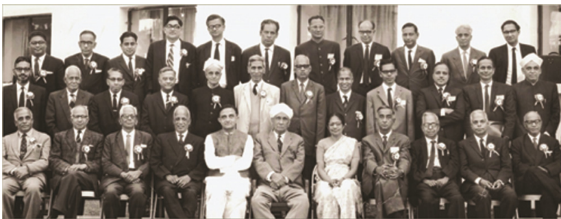
With Prof. C. V. Raman at the Indian Institute of Science, Bangalore