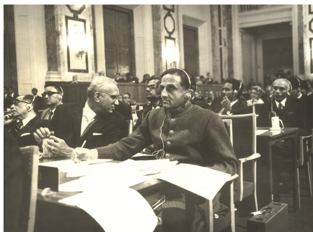
Attending a UN Conference on Atomic Energy