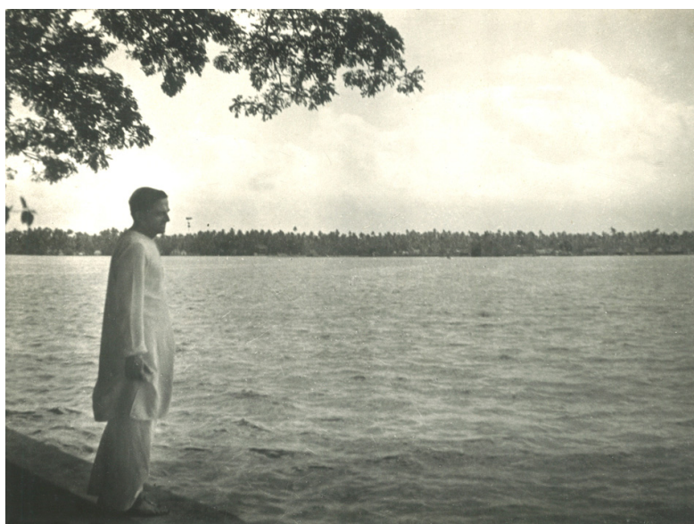
Vikram Sarabhai at sea shore