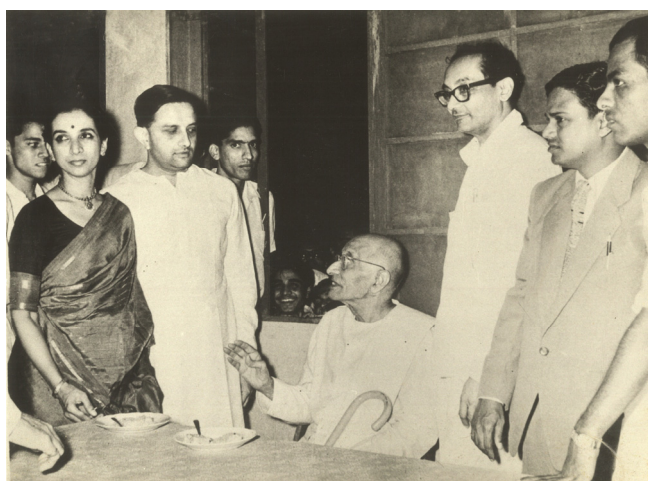
Vikram and Mrinalini with Shri Rajaji