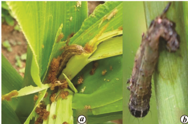
Figure 1. a , Fall armyworm (FAW) larva infesting maize plants. b , Nuclear polyhedrosis virus infected FAW larva.