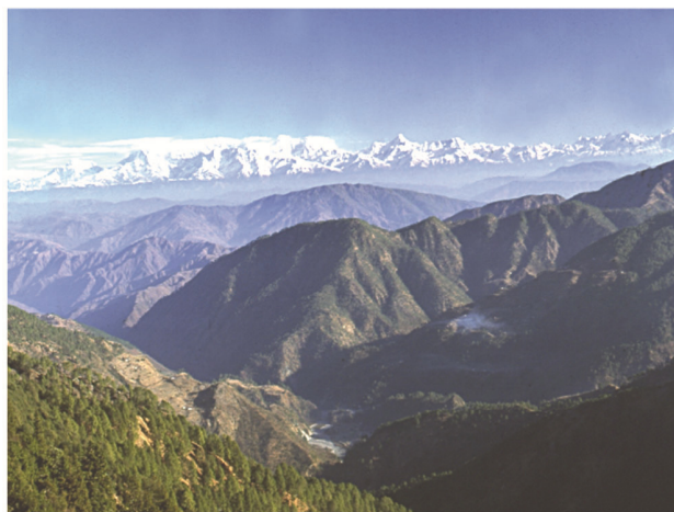
Figure 2. Photograph showing the Lesser Himalayan province, the narrow belt where the 2600–3000 m Lesser Himalayan ranges abruptly rise to the 6000–7500 m high formidable Great Himalaya, and the ever-snowy Great Himalaya.