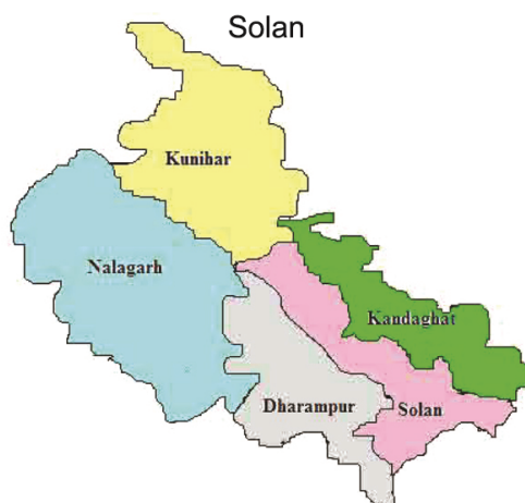
Figure 1. Map showing the study area of Solan district, Himachal Pradesh, India.

Data on the population of various land types such as crop land, grazing land, forest land and infrastructure land from different CD blocks were obtained from official certified records maintained by the Census of India, while data on yield and equivalence factors were derived from national footprint accounts in order to assess the EF of Solan district. Crop production, grazing, forestry and infrastructure all place mutually exclusive demands on the biosphere, and the total EF is the sum of these demands. Following the technique provided by the Global Footprint Network, each of these categories represents an area (ha), which is then multiplied by its equivalence factor to obtain EF (gha). Crop land footprint represents the amount of land required to grow all the crops that humans and livestock consume as is calculated by follows: Crop land footprint (gha) = Crop land area (ha) * equivalence factor