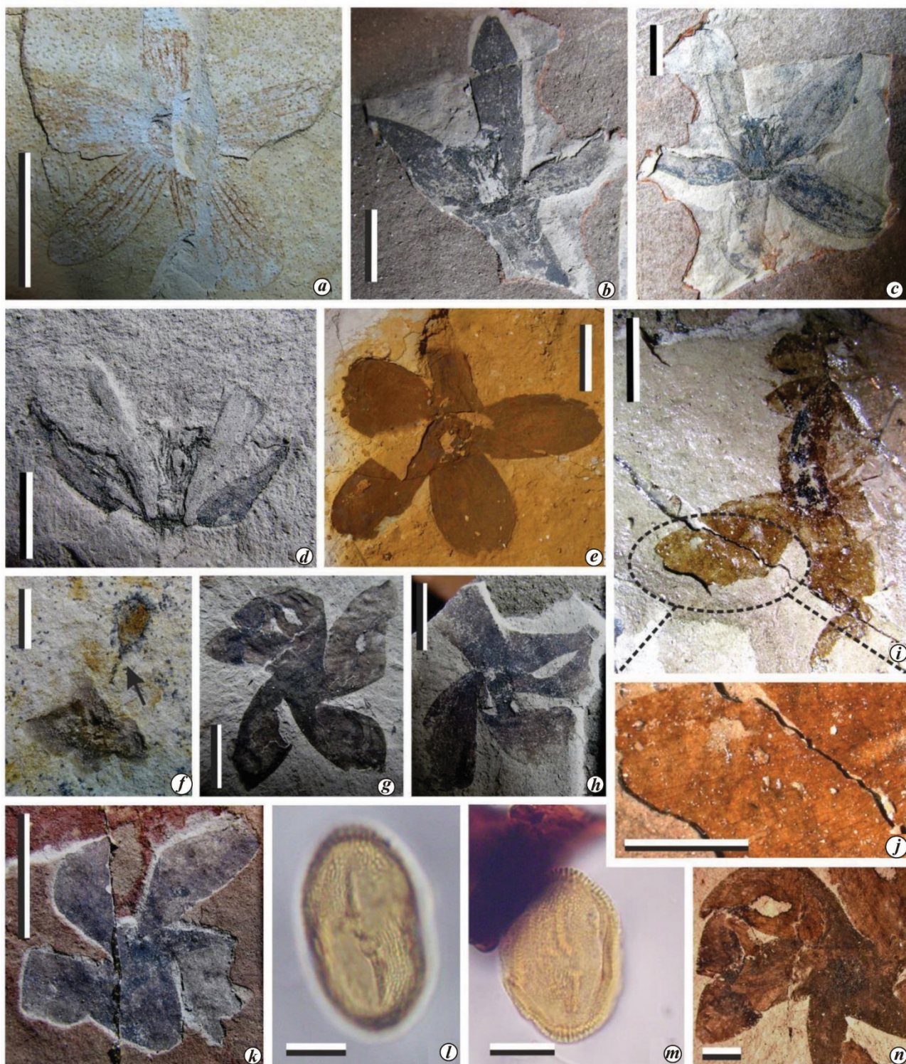
Figure 1. Recovered fossil flowers and pollen. a , Flower from the Barmer basin. b–k, n , Flowers from the Gurha lignite mine. f , A bud pointed by black arrow. j , Enlarged view of petal venation. l, m , The fossil pollen Rhoipites anacardioides Ramanujam recovered from the central portion of specimen c having preserved stamens. Scale represents 1 cm for a, d, e, f, j, k, n ; 0.5 cm for b, c, g, h, i ; 10 \mu m for l, m . Specimen numbers: BSIP 1/42199, 2/42199 ( a, e ). Specimen numbers: BSIP 1/42200, 2/42200, 3/42200 ( b–d ). Specimen numbers: BSIP 1/42201, 2/42201, 3/42201, 4/42201, 5/42201, 6/42201 ( f–k, n ). Specimen numbers: BSIP 1/17174, 2/17174 ( l, m ).

pedicel well preserved in some specimens; receptacle is swollen; calyx not preserved; corolla well preserved, usually twisted; pentamerous, polypetalous; 0.8–1.2 cm long, 0.4–