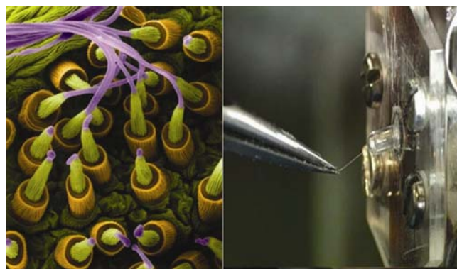
Figure 1. (Left) An electron microscope image of finger-like spinnerets of a spider. (Right) Biomimetic rig developed by Spinox.

Weaving is a process by which threads or continuous strands of any substance are crossed and interlaced so as to be arranged into a perfectly expanded form, and thus be used for covering human or other bodies. The technology of weaving was invented many years ago. Fabrics were being produced around 20,000 years ago 31 . The baya weaver ( Ploceus philippinus ) is a weaverbird found across South and Southeast Asia. The male weaverbird constructs its nest using fibrous materials. They weave the leaves and other nesting materials to produce a strong nest. The baya weaver might be the possible inspiration for human weavers. The weaverbird nest is usually 15 cm long and 12 cm high and is often suspended from a branch. The weaverbirds weave the outer shell of the nest progressively, stage by stage. These include construction of the initial attachment, ring, roof, egg chamber, antechamber, entrance and entrance tube. The initial attachment is constructed by first holding the initial strip under its foot against a twig, then looping it back and alternately reversing the winding of the strip between the twig and the strip itself, which is similar to 'nippering' a knot, a type of fastening used today to lash