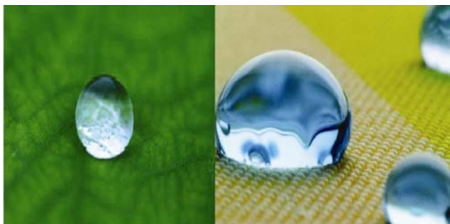
Figure 5. Lotus effect on the surface of a lotus leaf (left) and hydrophobic surface (right).

Characteristics of hydrophobicity and lotus effect: The primary parameter that characterizes wetting of a surface is the static contact angle, which is defined as the angle that a liquid makes with a solid. The contact angle depends on several factors, such as the surface energy, surface roughness and its cleanliness. If the value of the static contact angle is 0^\circ \leq \theta \leq 90^\circ , the liquid wets the surface, whereas if the liquid does not wet the surface, the value of the contact angle will be 90^\circ \leq \theta \leq 180^\circ . Surfaces with high surface energy, formed by polar molecules, tend to be hydrophilic, whereas those with low energy and built of non-polar molecules tend to be hydrophobic. Surfaces with a contact angle less than 10^\circ are called super hydrophilic, while those with a contact angle between 150^\circ and 180^\circ are called super hydrophobic. Wettability of a surface mainly depends on two factors: (i) the surface free energy, and (ii) the surface roughness. The self-cleaning property of a surface depends on its smoothness – extremely smooth surfaces show a reduced soiling behaviour, because the particles have only low mechanical hold and can be removed either by air or liquid. When overlapping structures with dimensions of a few micrometres and superposed structure of 50–100 nm are