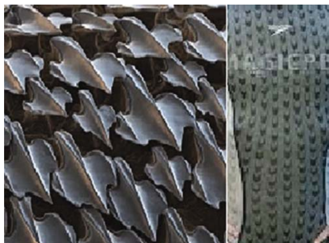
Figure 3. (Left) SEM of shark skin and (Right) Fastskin Fsii (FS2) swim suit, mimicking shark skin.

Coating surfaces with Sharklet is seen to greatly reduce the growth of bacterial colonies, due solely to the nano-scale structure of the product. The topography of Sharklet,