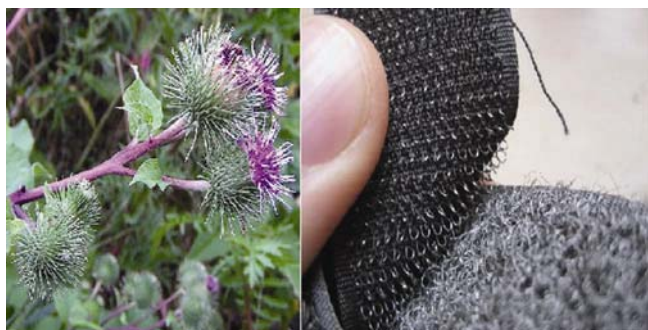
Figure 4. (Left) Arctium lappa , the capitula surrounded by an involucre made out of many bracts, each curving to form a hook, allowing them to be carried long distances on the fur of animals. (Right) Velcro, the brand name for fabric hook-and-loop fasteners, which is a biomimic material of A. lappa .

The gecko has a unique clinging ability; it can create dry adhesion using its amazing feet. Several creatures, including insects and spiders, have also developed unique