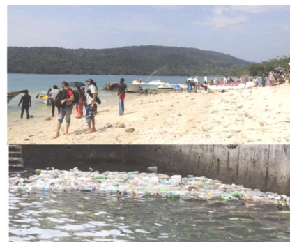
Figure 2. (Above) Growing domestic tourism along the coastal areas of Port Blair, Andaman. (Below) Plastic garbage left behind by the tourists seen floating along the pier.

Now the question is whether the ecologically fragile Andaman handle the influx of tourism in the coming years while