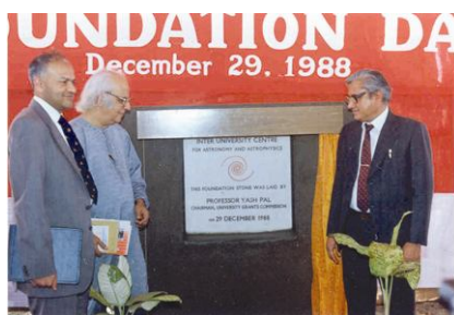
IUCAA Foundation stone laying ceremony.