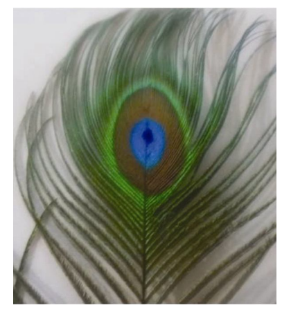
Figure 4. Late stage of the eye feather. Purple colour appears in the middle of the blue colour. The blue colour increases in size leading to the completion of pattern formation in the eye feather.

The most striking feature of the peacock is its multicoloured eyespot in the tail feather. The peahens are attracted towards the number and density of the eyespots at the time of selecting their mates<sup>9-11</sup>. Recently Dakin and Montgomerie<sup>3</sup> have reported that it is not the number but the colouration of the eyespot which plays a critical role in the mate selection process. In peacock, the eyespot development is a post-embryonic process, and various colours of the ring appear gradually. Furthermore, the colouration of the eyespot is due to structural colouration which is produced by the development of fine structures called barbules in the barb<sup>12</sup>. Although barbules have been reported in various birds such as hummingbirds, pigeons and kingfishers, the peacock possesses the largest iridescent barbules<sup>13</sup>. The fine structure along with visible light and pigments help in the formation of the multicoloured eyespot in the wing. Peacock tail possesses melanin as the pigment granule, which gives the barbs a uniform brown colour. The spectacular colours of the eyespot are due to an optical interference phenomenon, which is caused by a