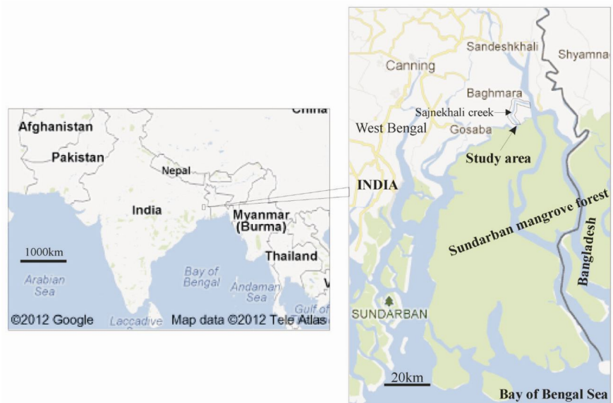
Figure 1. Google map showing the location of the studied Sajnekhali creek.

The Sajnekhali creek is about 20 km long and 300–400 m wide. It flows in a meandering course defining a nearly semi-circular shape (Figure 1). The average tidal velocity of flow at 20 km/h is strong enough to cause considerable lateral erosion of soft and muddy creek bank sediments. The following processes and features (Figure 3) were observed along the Sajnekhali creek along several kilometres.