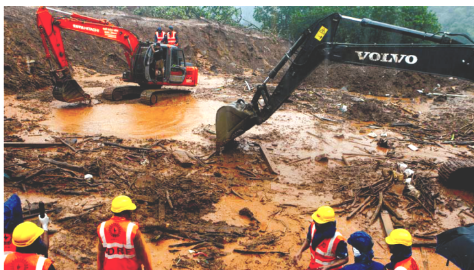
Figure 1. The mud avalanche of 30 July 2014 at Malin, Pune district, Maharashtra.

The other questions that must be asked are why the tragedy could not have been foreseen and avoided, and why the response was not quicker? The Malpa tragedy occurred at 00:37 a.m. on the 18 August 1998, after the symptoms that surfaced on the 14 August were ignored. The thunderous sound of the rock avalanche was heard on 18 August by around 00:25 a.m. Five minutes later, the sky witnessed fireworks due to colliding boulders. Closely on the heels of this came the fury of a dust storm. We had no preparedness to capture these signals and the first message of the tragedy could be radioed from ITBP only at 05:25 a.m.;