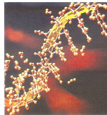
Nicked DNA molecule; source: OSDATA.

The chapter on tumour immunology describes basic biology of cancer and its