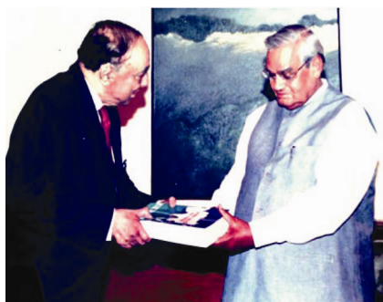
Presenting to the Prime Minister Atal Behari Vajpai the Proceedings of the IX Asian Congress of Nutrition , New Delhi, 2003.

After laying down office at ICMR, Gopalan developed an Action Programme in Nutrition for South East Asia, as consultant to the WHO.