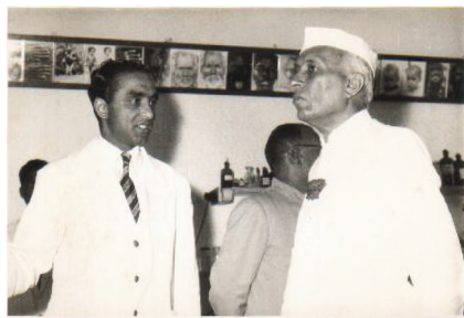
Gopalan explaining the work done at NRL to Prime Minister Jawaharlal Nehru (1950).

As a newly minted doctor in 1940, having qualified for his MBBS degree with flying colours, Gopalan had already begun to realize where his true interest lay. Those were the times when India was a veritable museum of florid clinical forms of nutritional deficiency diseases like, Kwashiorkor (protein-calorie malnutrition), keratomalacia (blindness due to vitamin A deficiency), rickets and osteomalacia (vitamin D deficiency), beri beri (vitamin B1 deficiency), pellagra (niacin deficiency), scurvy (vitamin C deficiency), severe iron deficiency anaemia aggravated by malaria and hook worm infection, pendulous goiters (iodine deficiency), etc. The nutrition ward in Madras Stanley hospital of which Gopalan was in charge as house surgeon, was full of these cases. He realized that thousands more existed in the countryside, for whom medical help was out of reach. And then in 1943 came the Great Bengal Famine that killed an estimated 2.5 to 3 million people – far more than all the lives lost in the World War II. The die was cast. This was the turning point when this young doctor decided to devote his medical career to ‘the investigation and mitigation of the nutrition-related problems of Indians, especially