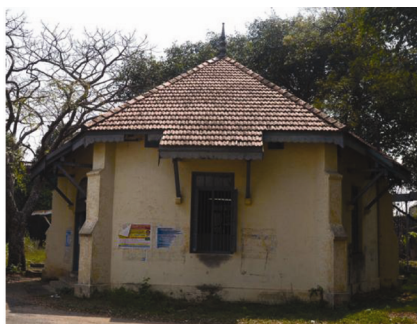
Figure 1. The vaccine depot, the precursor of the King Institute of Preventive Medicine.

The King Institute of Preventive Medicine (KIPM) in Guindy, about 10 km from the central business district of Madras, was formally opened by Lord Amptill (note 1) in November 1905, celebrating the life and achievements of Walter Gaven King, who was chiefly responsible for its start. KIPM was already functioning as a vaccine depot supplying smallpox-vaccine lymph (Figure 1) to people in the Madras Presidency, supervised by King from the 1890s. By 1905, it had grown into a large provincial facility, housing a well-equipped bacteriological laboratory and a public-health laboratory in addition to the original vaccine depot. It essentially included a vaccine section, which manufactured calf lymph for vaccination against small pox and a microbiological section, enabling investigations necessary in medical diagnosis and public-health related work 1 . The main building housed the microbiological section and the vaccine section remained scattered all over the precinct. In 1903, KIPM had a guaranteed and secured water supply, lighting and sewerage system, besides a large refrigerating system which enabled storing of smallpox-vaccine lymph, bacterial vaccines, various sera and other perishable medical and veterinary supplies. As a public-health facility, KIPM uniquely included a series of