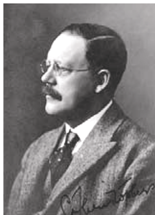
Figure 4. S. R. Christophers.

canis (today, Babesia canis , Aconoidasida: Piroplasmida: Babesiidae) by Rhipicephalus sanguineus (Parasitiformes: Ixodidae) 11 . Christophers was later posted as the Director of Central Malaria Bureau, where he made impressive contributions to malariology and to the knowledge of mosquitoes. While at the