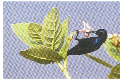
Purple Sunbird drinking flower nectar (photograph © K. Gnanaskandan).

The book is well illustrated with numerous photographs and a handful of maps. Although mammals are also dealt with, the focus of the book has been on birds. The author has discussed birds as pollinators, as predators of insect pests, as dispersers of seeds and also as crop-raiders. The fact that the proportion of Indian birds that play a helpful role in the