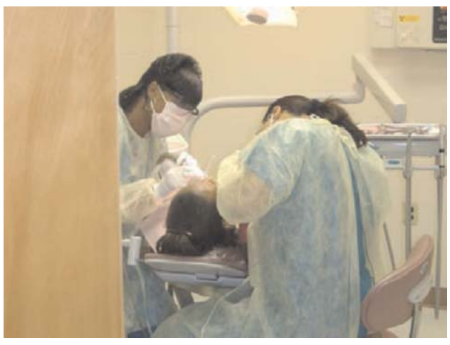
Figure 2: Steady posture

Steady posture (Figure 2) shows a slight forward bend with the neck and head tilted in an effort to get a better view, while the arms are elevated and unsupported. As this posture becomes the normal working position, the muscles responsible for supporting the working posture become stronger and shorter while the