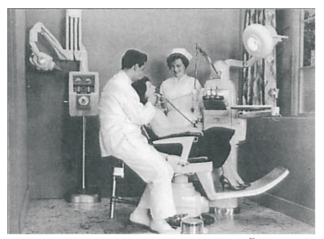
Figure 1: Upright posture {Biller 1946}<sup>20</sup>

Orthostatics posture (upright posture) (Figure 1) Although the manual work like the determination of occlusion, some extractions can be performed only in