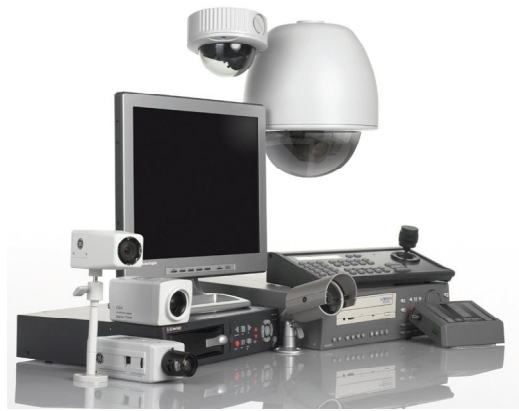
Figure 1: Main parts of CCTV

As world population increases, traffic control is becoming a critical application for CCTV. CCTV provides a way to monitor multiple cameras internally and analyse generated images to extract useful information [5] about traffic parameters, such as speed, traffic composition, vehicle shapes, vehicle types, vehicle identification numbers and occurrences of traffic violations or road accidents. This offers a great help for transportation authorities, allowing them to make decisions accordingly and distribute traffic information to drivers [6], resulting in improved traffic flow, prompt accident detection, shorter journey time, less fuel consumption, reduced emissions and more satisfied travelers [7][8].