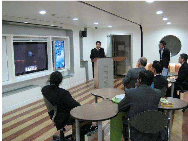
Fig 6.1 U-Learning Lab of Korea

South Korea has one of the most advanced ICT infrastructures in the world [23]. The use of ICT is mostly spread into the higher educational system. There are currently 15 single-mode virtual universities. They offer only ICT-based courses. The Korea Cyber University, the Korea Digital University, and the Open Cyber University are the most popular among them. Lifelong learning and vocational education are the speciality of these universities. In 2002, the total enrolment of them is 17,200. A wide range of fields are offered by them. These include technology, management, law, languages, social sciences, education, and theology.