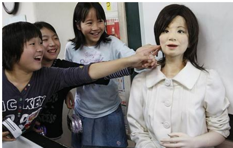
Fig 6.2 Robot teacher in the classroom of Tokyo

Figure 6.2 shows a Robot teacher in the classroom of Tokyo in Japan. We have the dream for being our education sector as advanced as in the country we have discussed here.