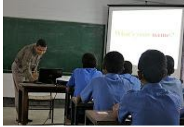
Fig: 5.2 Multimedia Classroom [22]

(B) The Multimedia Classrooms are introduced in secondary schools. A laptop with a projector and screen are used to assist teaching different subjects. In the case of shortage of science laboratories and illustrated textbooks, it is an ideal tool for illustrating topics. The Asian Development Bank was happy to see the quick achievement of the A2I staff and the Ministry of Education. They have become the partner to provide resources for teacher training. So far around 1,000 teachers have been trained with some 50,000 targeted over the next few years. The equipment is purchased by the schools. Bangladesh has the plans to eventually provide computer labs in all schools [22]. The Multimedia Classroom is the first step in it.