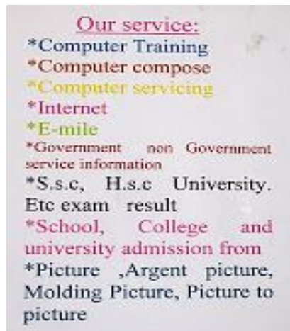
Fig: 5.1 UISC offered services [22]

(A) Union is the lowest administrative division of Bangladesh. There are 4,498 Unions in the country. Union Information Service Centre (UISC) has been installed in all unions of Bangladesh.