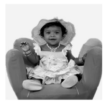
Figure 6. Original Image

Implementation of the techniques was done on different images. Colored images were converted into gray scale image and then segmentation and recognition methods were applied. A sample grey scale image (figure 6) is considered for segmentation and object recognition using Sobel, Prewitt, Roberts, Canny, LoG, EM algorithm, OSTU algorithm and Genetic Algorithm. The segmented image and recognized image using different edge operators' techniques are shown in Table 2.