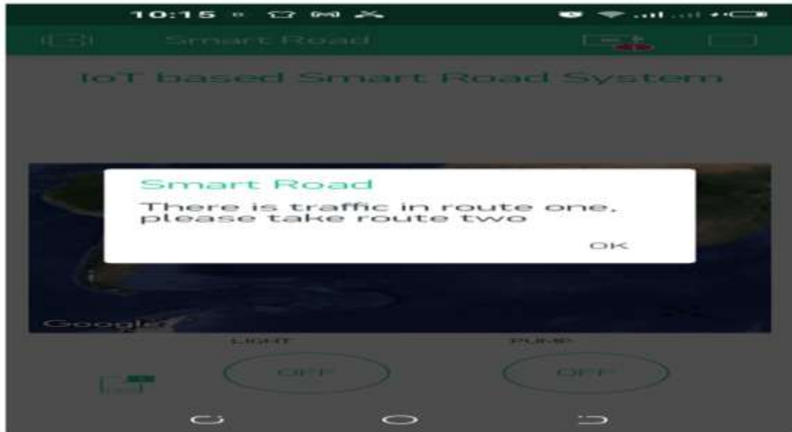
Figure 4. Output Design

The system has achieved a novelty by integrating multiply IoT functions in one unit, resulting in a robust system that raises road users' awareness of traffic hazards; controls the lights on the road automatically; warns road users of pollution, fire disaster, and road danger to ensure road users' safety; and could automatically set fires and irrigate crops on the side of the road.