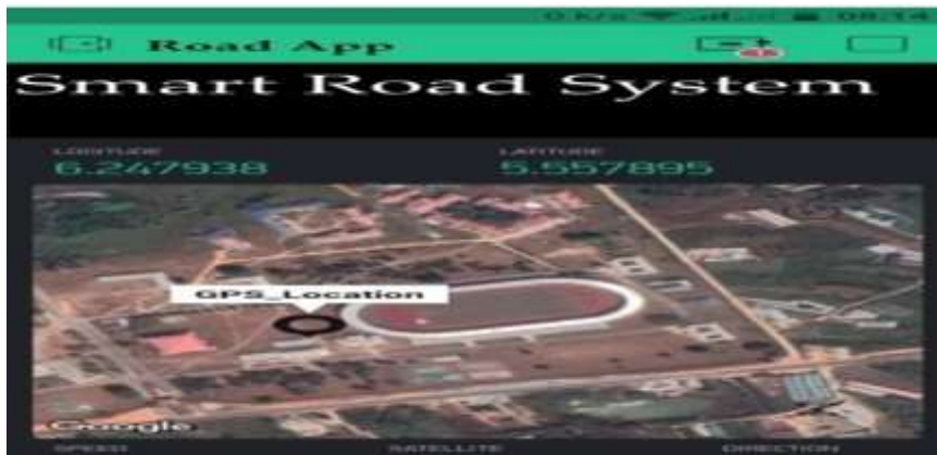
Figure 1. Main Menu