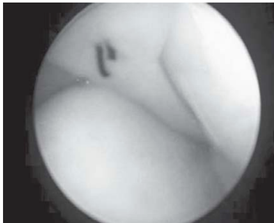
Figure 3 After Repair