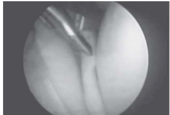
Figure 5 Biting with Basket Forcep