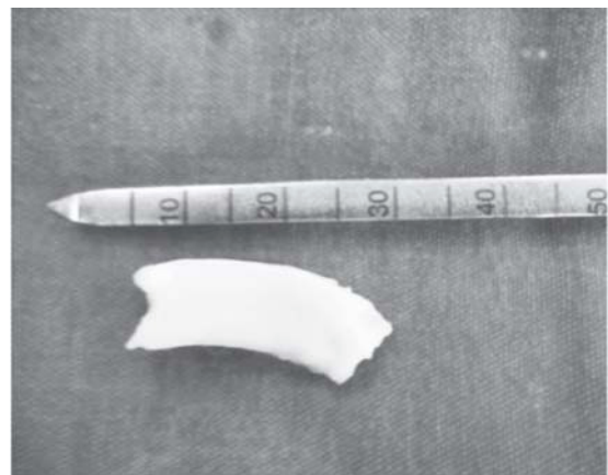
Figure 6 Resected Meniscal Fragment