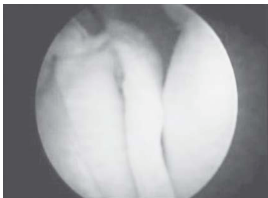
Figure 4 BHMM Tear