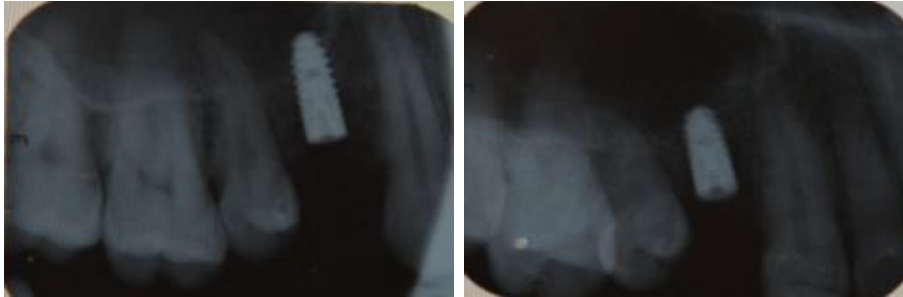
Fig. 4 IOPA after implant placement and after 4 months