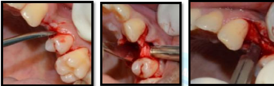
Fig. 2 Incision and reflection of the flap followed by ridge splitting

On evaluation it was found that the left premolar region had only 7 mm bone and an indirect sinus lift procedure with immediate implant placement was planned. The rest of the areas had adequate bone height. Blood examination was performed and antibiotic prophylaxis was given 1 day prior to the surgery.