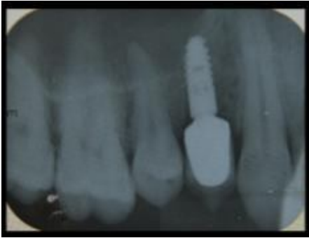
Fig.6 IOPA after crown cementation