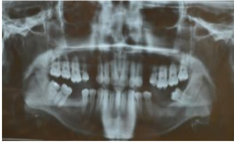
Fig. 1 Preoperative OPG

radiographic examination using OPG. (Fig. 1)