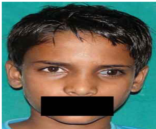
Fig.3 Final wax pattern try-in

The technique was modified here onwards by trimming the iris portion of the stock eye and orienting it on the cast according to previously transferred pupillary mark. Carving wax mixed with sticky wax was poured into cast, taking care not to displace the iris from its previously oriented position, in the wax pattern. This iris-wax pattern combination was placed in socket (Fig. 3) and modified for adequacy of ocular movements, correction of pupillary alignment, proper palpebral movements, scleral contour and convexity.