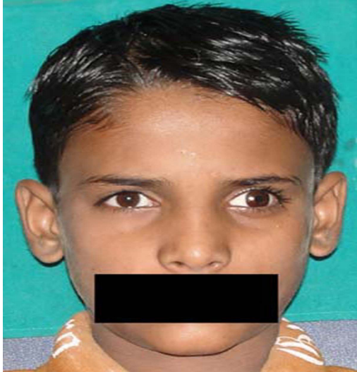
Fig. 5 Post-operative photograph showing prosthesis in lieu of defective eye

month, 3 months, later followed by 6 monthly recall appointments, to facilitate relining of ocular prosthesis when necessary.