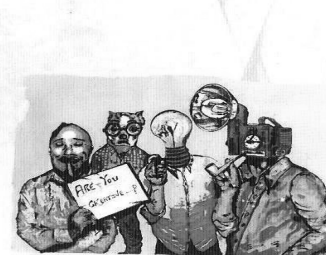
The Creativity Dope | Serigraphy | 26"x3 Editions: