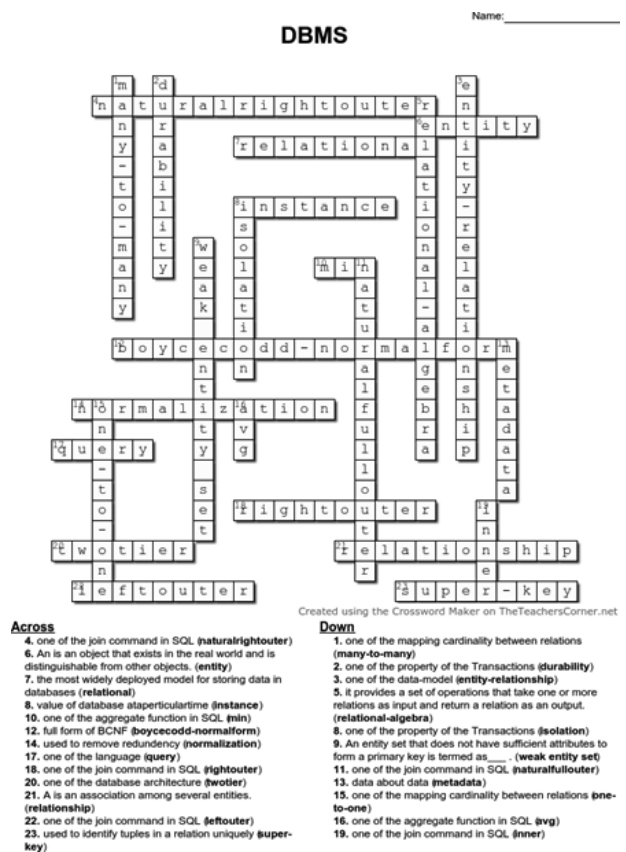
Fig 2 : Crossword with Answers