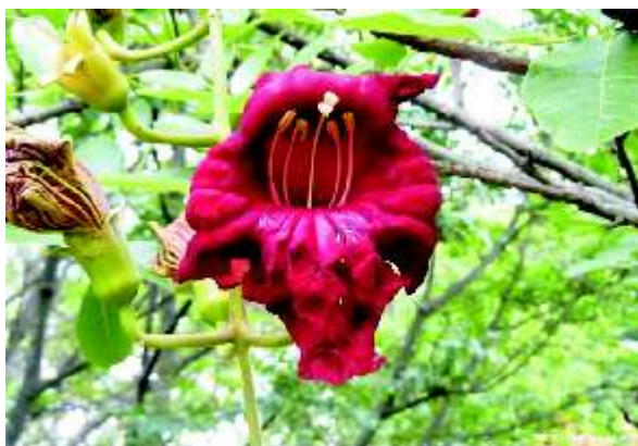
Fig. 2: K. pinnata leaves