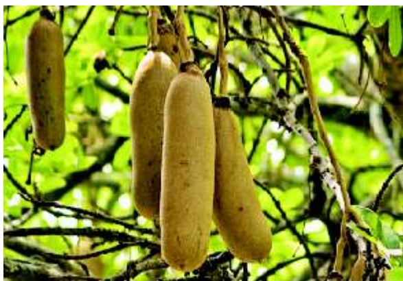
Fig. 1: K. pinnata fruits