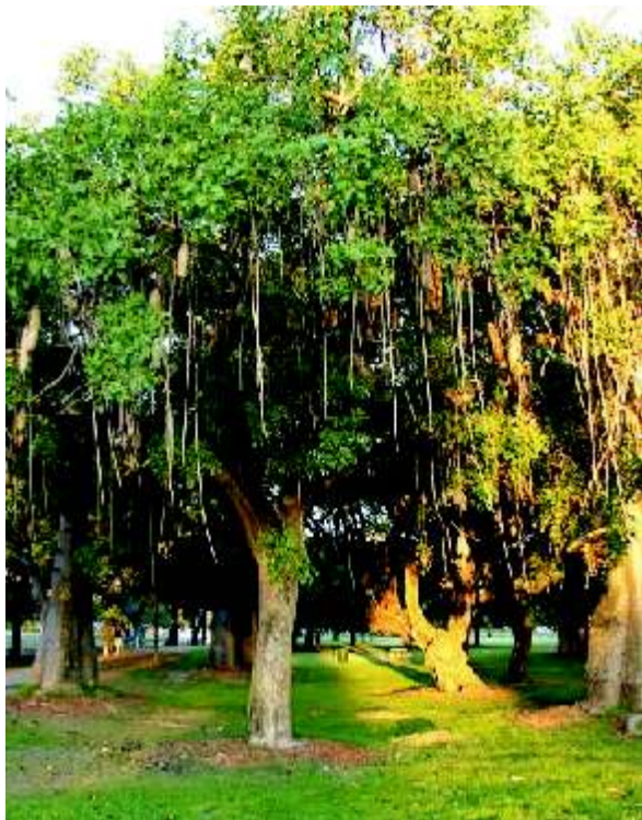
Fig. 3: K. pinnata tree