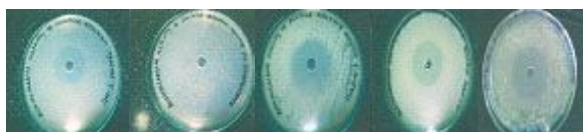
Fig. 1 : Inhibition Zones of Aflatoxin against Test Organisms

Antimicrobial activity of Patulin was observed highest against Micrococcus luteus (Fig. 4), Proteus sp. was found to be more sensitive to Terrecyclic acid (Fig. 5), Micrococcus sp. was found most sensitive against Deoxynivalenol generating zone of inhibition 32.66 mm in case of crude and 47.66 mm in case of purified extract (Fig. 6) and Malformin was found highly effective against Proteus sp. (Fig. 7). The findings of patulin, Terrecyclic acid, deoxynivalenol, Malformin are tabulated comparing the zone of inhibition in crude and purified form of the extract (Table 2).