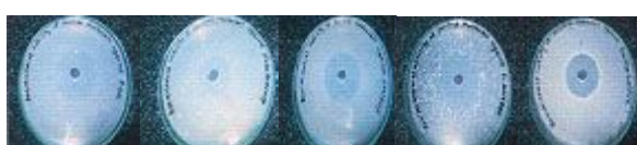
Fig. 7 : Inhibition Zones of Malformin against Test Organisms