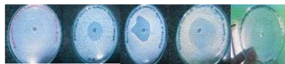
Fig. 9 : Inhibition Zones of Trichorzin against Test Organisms