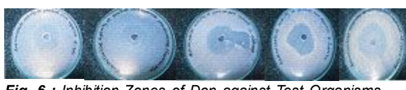
Fig. 6 : Inhibition Zones of Don against Test Organisms