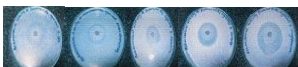
Fig. 8 : Inhibition Zones of Fumonisin B2 against Test Organisms