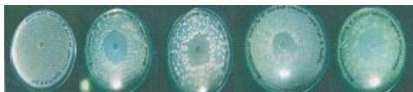
Fig. 3 : Inhibition Zones of Penicillin against Test Organisms