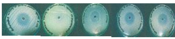
Fig. 4 : Inhibition Zones of Patulin against Test Organisms