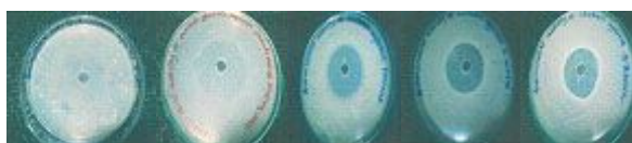
Fig. 2 : Inhibition Zones of Gliotoxin against Test Organisms