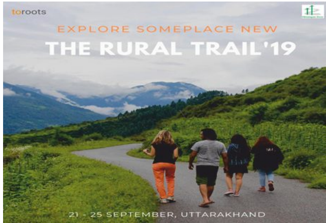
Image 1 - Digital media promotion of ToRoots