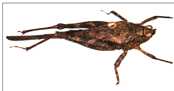
Fig. 6. Hedotettix rusticus Bolivar, 1887