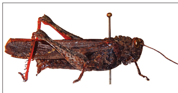
Fig. 2. Coptacra tuberculata Ramme, 1941