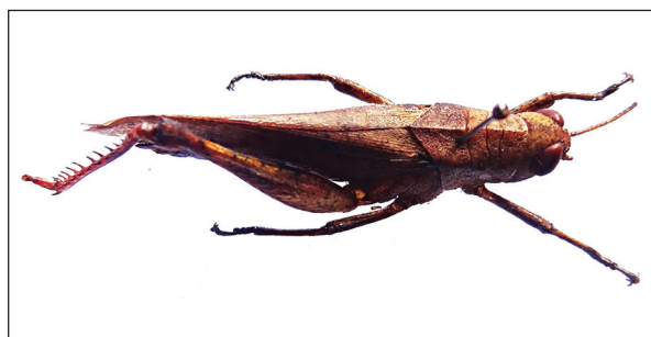
Fig. 1. Gerenia selangorensis Miller, 1935