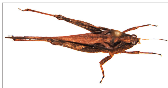
Fig. 7. Hedotettix angustatus Hancock, 1909