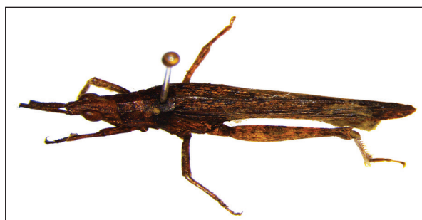
Fig. 5. Pyrgomorpha (Pyrgomorpha) conica fusca (Beauvois, 1807)