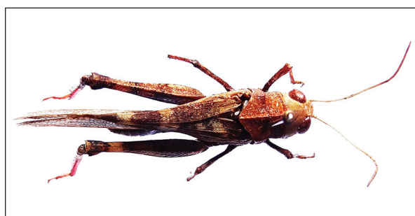
Fig. 3. Pternoscirta pulchripes Uvarov, 1925