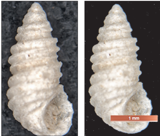
Fig. 3 & 4. Stosicia annulata (Dunker)

Material Examined: 4 examples; Karnataka; Gangoli Estuary, Station S3: 13° 34' 12.90" N and 74° 28' 57.36 E and S4: 13° 39' 41.17 N and 74° 24' 51.22 E about 20km inside the sea, Date Of collection: 25.02.1007; Name of Collector: A.K. Mukhopadhyay and party.