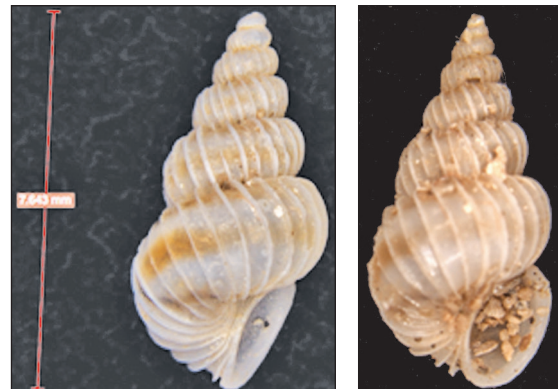
Fig. 5 & 6. Epitonium lyra (Sowerby)

1995. Epitonium lyra : Donald Bosch, Peter Dance, Robert Moolenbeek and Oliver, Sea shell of Eastern Arabia : 48, pl. 136.