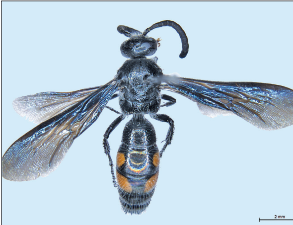
3. Body profile