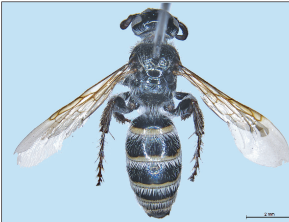
1. Body profile