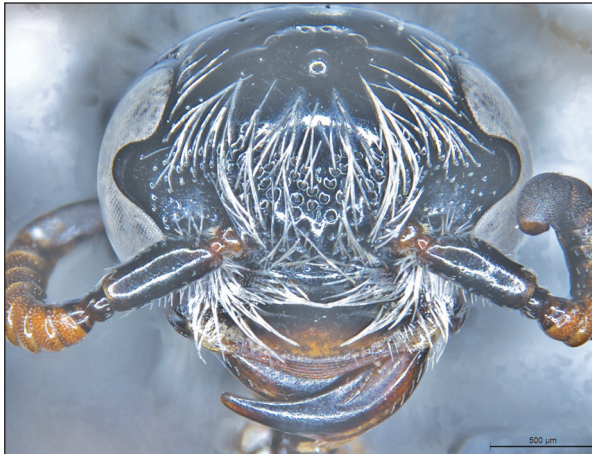
2. Head frontal view