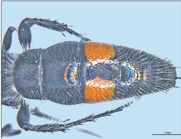
6. Abdomen in different specimens