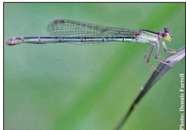
Agriocnemis pygmaea (Rambur, 1842) Female