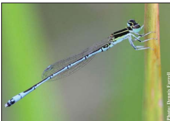
Agriocnemis nana (Laidlaw, 1914) Male