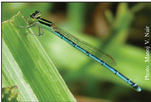
Agriocnemis pieris Laidlaw, 1919 Female