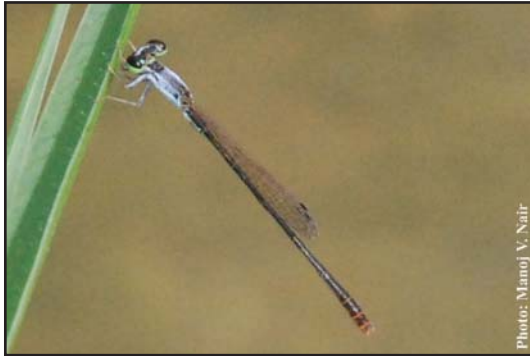
Agriocnemis femina (Brauer, 1868)