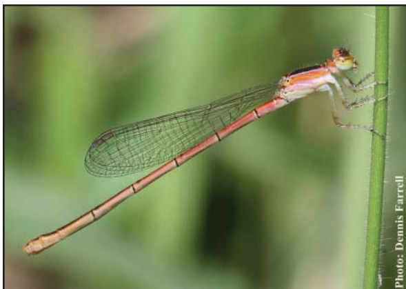
Agriocnemis pygmaea (Rambur, 1842) Female