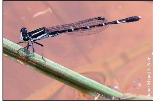
Agriocnemis splendidissima Laidlaw, 1919