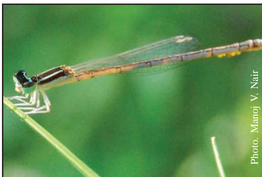
Agriocnemis lacteola Selys, 1877 Female