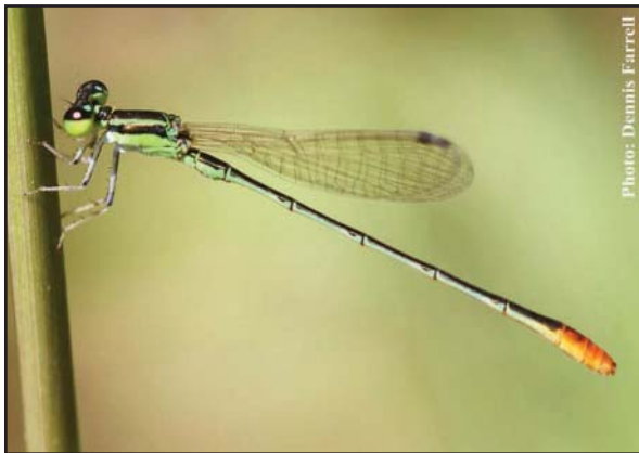
Agriocnemis pygmaea (Rambur, 1842) Male