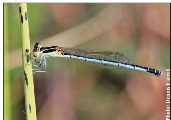
Agriocnemis nana (Laidlaw, 1914) Female