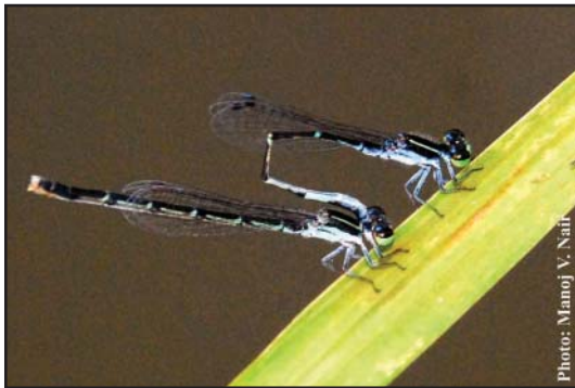
Agriocnemis splendidissima Laidlaw, 1919 in coupla