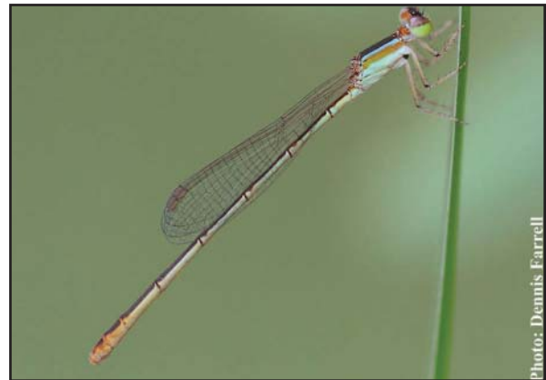
Agriocnemis pygmaea (Rambur, 1842) Female