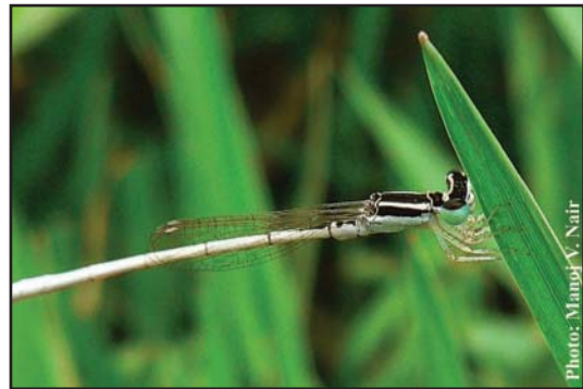
Agriocnemis lacteola Selys, 1877 Male