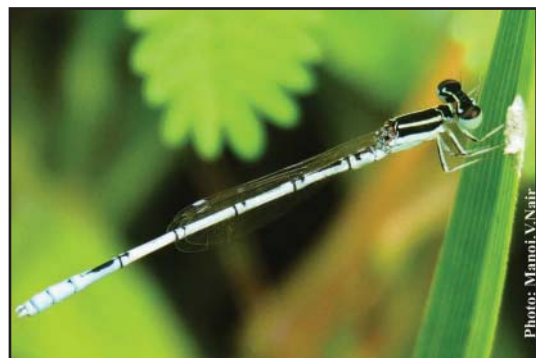
Agriocnemis pieris Laidlaw, 1919 Male