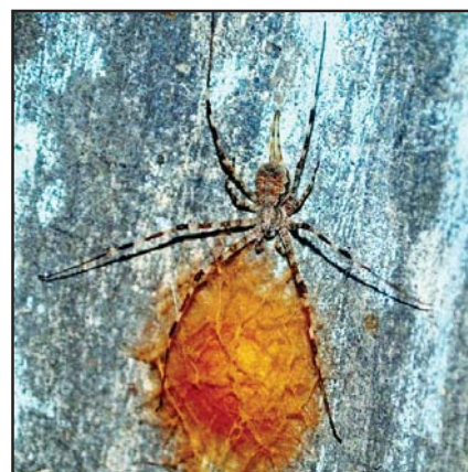
Fig. 2. Hersilia savignyi Lucas, 1836 besides its cocoon case.

Territoriality: Hersilia savignyi Lucas, 1836 commonly known as "two tailed spider", is generally found to our surroundings. Geological changes have great impact on the adaptive mode of life of this spider.