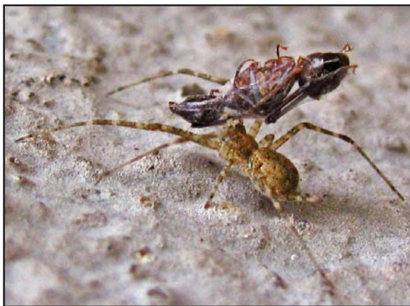
Fig. 3. Hersilia savignyi Lucas, 1836 carries Tetraponerarufonigra Jerdon, 1851 after predation within a silk case.

Food and Feeding habit: While the most spider species generally hunt at night here our observation supports the fact of H. savignyi predating behaviour exclusively extends both day and night. In the experimental time period it was observed that a fasting H. savignyi predated on Blattella germanica Linnaeus, 1757, Tetraponerarufonigra Jerdon, 1851, Camponotus angusticollis sanguinolentus Forel, 1895, Camponotus compressus (Fabricius, 1787), Camponotus ( Orthonotomyrmex sericeus (Fabricius) and Dipteran flies as food source.