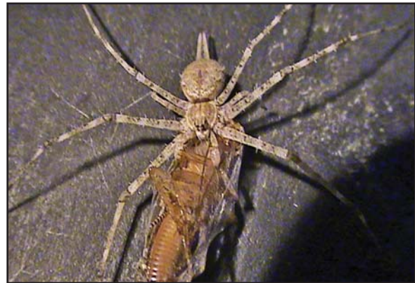
Fig. 4. Hersilia savignyi Lucas, 1836 predates on a comparatively large prey Blattella germanica Linnaeus, 1757.

female carry the item (Figure 3 & 4) to a suitable place, preferably near or into the cocoon, then suck the juice from the food. If movable object is unpalatable or stronger than the spider, it retreats backward. A schematic technique of Prey capturing process of H. savignyi drawn as per observation (Figure 5) is pertained.