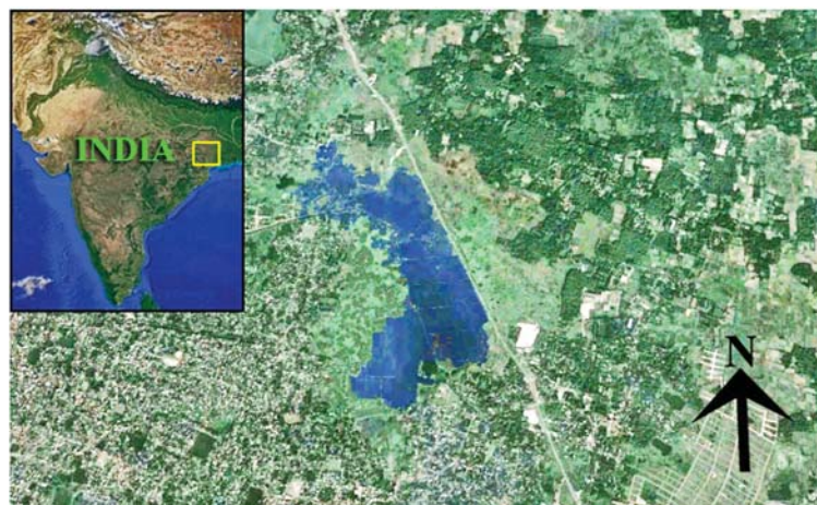
Fig. 1. Study area

The present paper deals with the micro-adaptive predated behaviour of Hersilia savignyi Lucas, 1836 along with its short instinctive memorizing